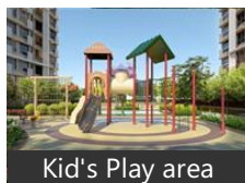
Kid's Play area