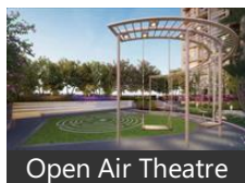
Open Air Theatre