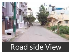
Road side View