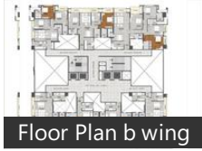
Floor Plan b wing