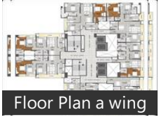
Floor Plan a wing