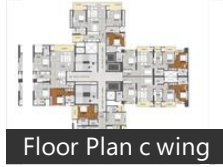
Floor Plan c wing