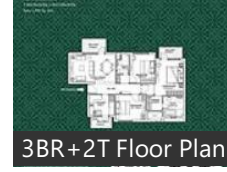
3BR+2T Floor Plan