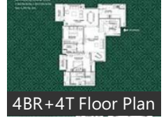
4BR+4T Floor Plan

* These floor plans are of the project and might not represent the property