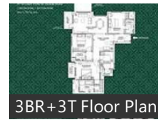
3BR+3T Floor Plan