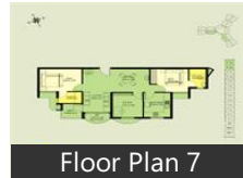
Floor Plan 7