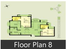
Floor Plan 8