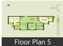
Floor Plan 5