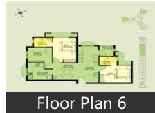
Floor Plan 6