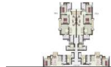
3 BHK Type B

* These floor plans are of the project and might not represent the property