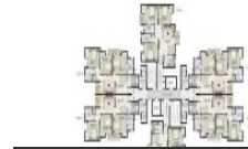
3 BHK Type A