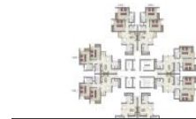
2 BHK Type B