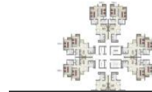
2 BHK Type A