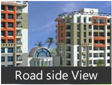
Road side View