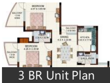
3 BR Unit Plan