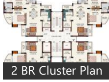
2 BR Cluster Plan