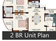
2 BR Unit Plan