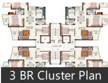
3 BR Cluster Plan