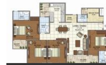
4 BHK - 1950 sq ft