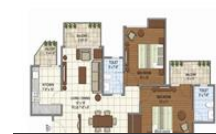
2 BHK - 1150 sq ft