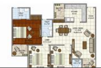
3 BHK - 1415 sq ft