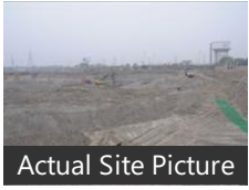
Actual Site Picture