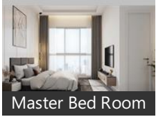
Master Bed Room