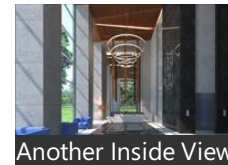
Another Inside View

* These pictures are of the project and might not represent the property