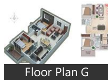
Floor Plan G