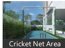
Cricket Net Area