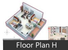
Floor Plan H