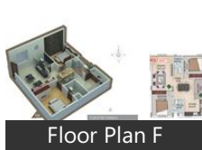
Floor Plan F