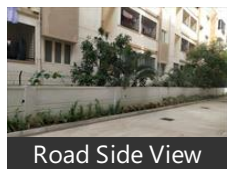
Road Side View