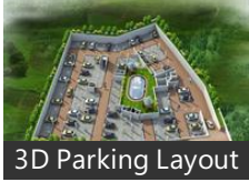
3D Parking Layout