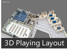
3D Playing Layout