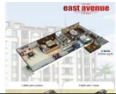
3BHK - Floor Plan