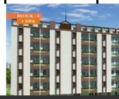
Side View - B