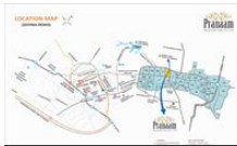
Location Map - B