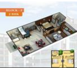
2BHK - Block F Plan