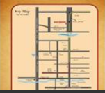
Location Map - A