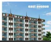
Side View - A