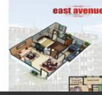
1BHK - Floor Plan