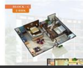
2BHK - Block G Plan