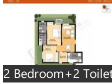
2 Bedroom + 2 Toilet