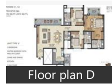
Floor plan D