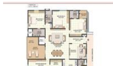
East Facing 3380