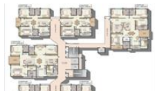
Sector-A - Type-C