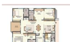
East Facing 2540