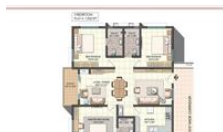
East Facing 1535