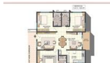
West Facing 1535