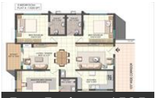
East Facing - 1535