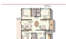
West Facing 1875