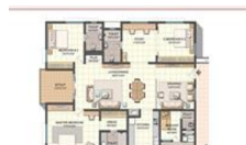
East Facing 2540