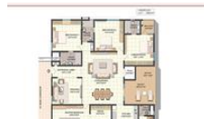
West Facing 3380