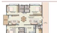
East Facing - 1875