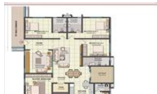
West Facing - 2630