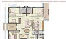
East Facing - 2630