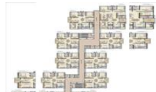
Tower 02, 03 and