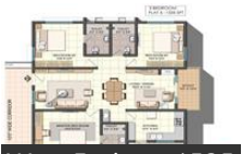
West Facing - 1535