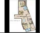
Floor Plan K