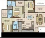
Floor Plan j