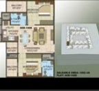
Floor Plan I