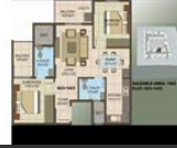
Floor Plan G