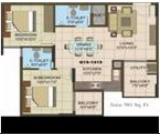
Floor Plan L