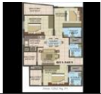
Floor plan A