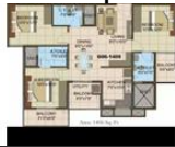
Floor plan B