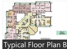
Typical Floor Plan B