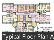
Typical Floor Plan A