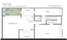
Floor Plan 1