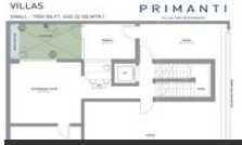
Floor Plan 2