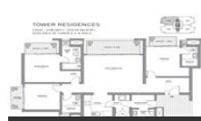
Floor Plan 4