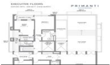
Floor Plan 5