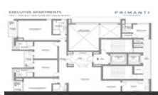
Floor Plan 3