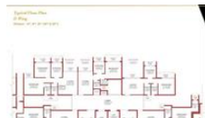
Floor Plan E