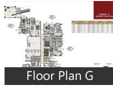
Floor Plan G