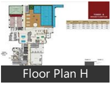
Floor Plan H