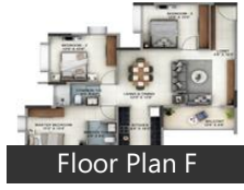
Floor Plan F