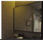
Guest rest room