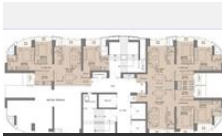
Refugee Floor Plan