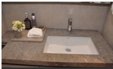
Guest rest room