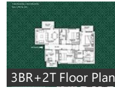
3BR+2T Floor Plan