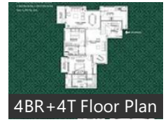
4BR+4T Floor Plan

* These floor plans are of the project and might not represent the property