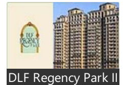
DLF Regency Park II

* These pictures are of the project and might not represent the property