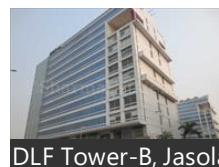
DLF Tower-B, Jasola