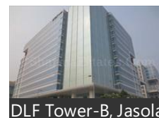
DLF Tower-B, Jasola