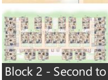
Block 2 - Second to