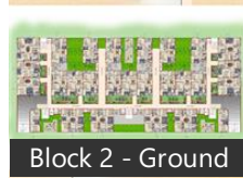
Block 2 - Ground