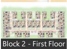
Block 2 - First Floor