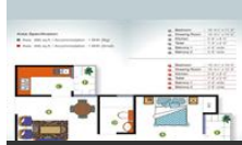
1 BHK - 645 / 695