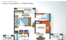
2BHK (Big) - 995