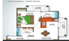
2 BHK (Small) - 890