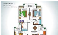
3 BHK (Small) -