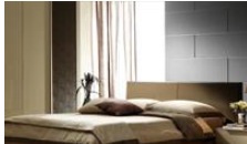
Master Bed Room