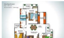
3BHK (Big) - 1405