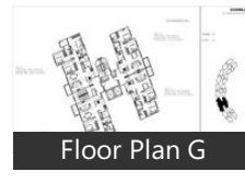
Floor Plan G