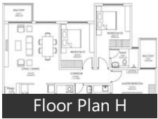
Floor Plan H