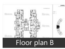
Floor plan B