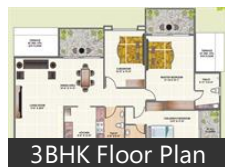
3BHK Floor Plan