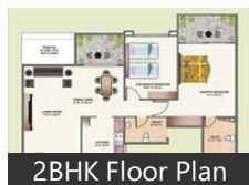
2BHK Floor Plan