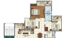
Floor Plan - 3 BHK