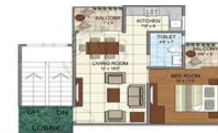
Floor Plan - 1 BHK