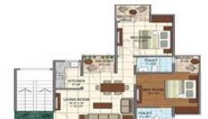
Floor Plan - 2 BHK