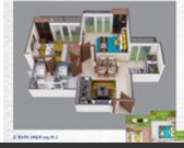
Floor plan B