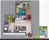
Floor plan A