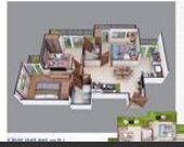
Floor plan C