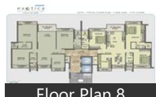
Floor Plan 8