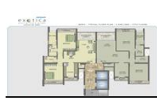
Floor Plan 2