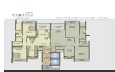
Floor Plan 3