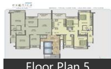
Floor Plan 5