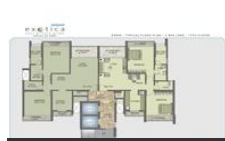
Floor Plan 1