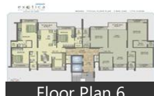
Floor Plan 6