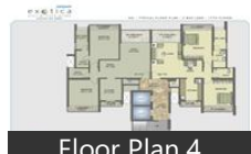
Floor Plan 4