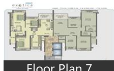
Floor Plan 7