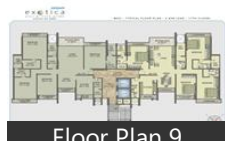
Floor Plan 9