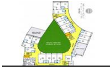
Tenth Floor Plan