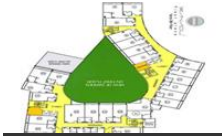
1st to 9th Floor Plan