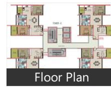
* These floor plans are of the project and might not represent the property

Whitefield is the major it hub with so many international companies and world class infrastructures