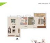
Floor Plan D