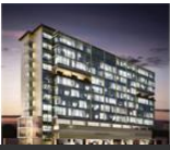
Night View A