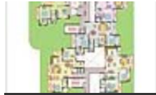
Block-A Floor Plan