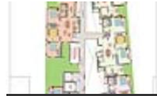
Block-B Floor Plan