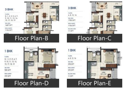
* These floor plans are of the project and might not represent the property

Whitefield is the major it hub with so many international companies and world class infrastructures