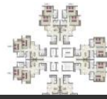
2 BHK Type B

Disclaimer: The reviews are opinions of PropertyWala.com members, and not of PropertyWala.com.