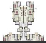
3 BHK Type B

* These floor plans are of the project and might not represent the property