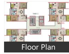
* These floor plans are of the project and might not represent the property

Whitefield is the major it hub with so many international companies and world class infrastructures