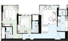
Floor Plan F