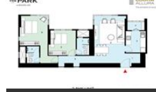
Floor Plan G