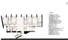
Floor Plan E