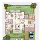
3BHK - Floor Plan