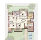
3BHK - Floor Plan

* These floor plans are of the project and might not represent the property