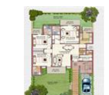
3BHK - Floor Plan