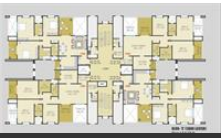
Bldg C Odd Floor