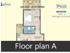
Floor plan A