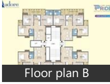
Floor plan B