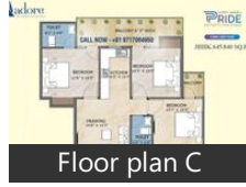
Floor plan C