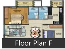
Floor Plan F