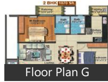
Floor Plan G