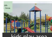
kids play area