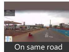
On same road