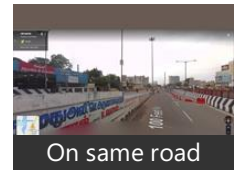
On same road