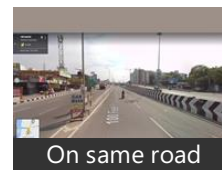
On same road